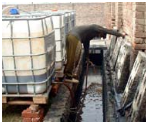
Application of EM

To start with 1m 3 EM extended was applied immediately to the effluent at a point in the medium size drain, where it has just reached after screening through the fine sieve, before entry into the equalization tank. After which a suitable quantity of EM extended was continued to be dripped daily from 09:00 to 22:00 hours at the same point in the medium size drain.