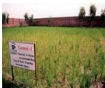
(A) Control Difference