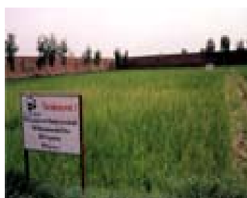
(B) EM Treated

It can be established with further research on agriculture land under farmer's conditions that the application of bio-sludge and EM products (Bokashi or compost prepared with rice husk, rice bran, FYM) combined with EM extended irrigations will show better yields as compared to conventional fertilization (NPK fertilizers). The layout plan is given in figure-6.1.